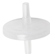
.45 µm and .22 µm filters